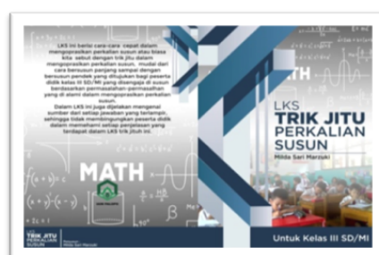
Figure 2 The cover of the Perfect Tricks Worksheet

At the stage of designing a product, there are several things that have been prepared by the researcher, to design a teaching material in the form of a student worksheet (student worksheet) that can make it easier for students to understand the multiplication stacking method. As for the things that need to be prepared by the researcher first, starting with the making of the cover of the right trick worksheets, which is the initial part in the development of the stacking multiplication accurate trick worksheets. according to the material developed and the provision of colors suitable for the character of the students and the pictures given according to their age.