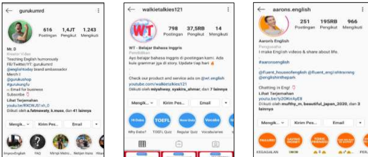
Figure 1. Teachergrams accounts

The figure 1 displays three examples of hundreds teachergrams who teaches English. The figure above reports that they have thousand of followers (people who follow the learning material/content of the teachergrams), one of them are having more than a million followers. This is indicated that everytime the teachergrams shares their material it will be seen by hundreds or millions of people in one time. Huge number of people will learn English easily through their smartphone by the existence of teachergrams.