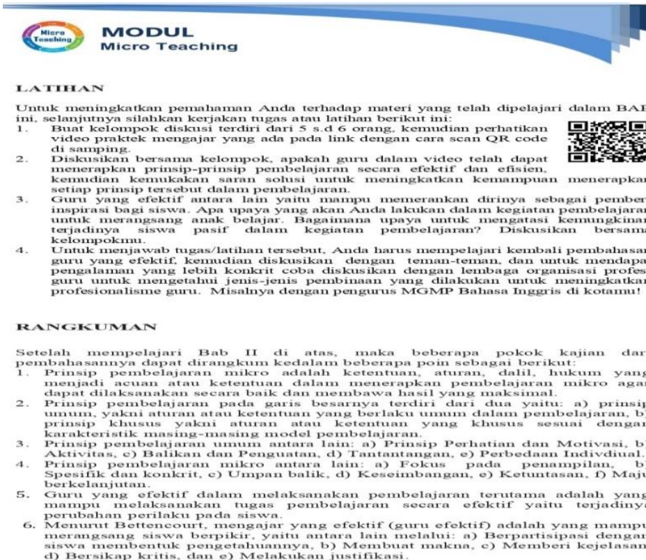
Gambar 2. Exercise/ Practice

module is equipped with images that can illustrate the contents of the discussion material in each chapter. In addition, the module is designed to be interesting to read. At the beginning of each chapter, tips and motivation are provided which are expected to encourage students, apart from studying the material more deeply, it can also inspire them to develop themselves. These expressions or proverbs are related to the fields of education and teaching so that they are more meaningful. This is one of the dimensions of self-esteem in terms of respect and self-respect.