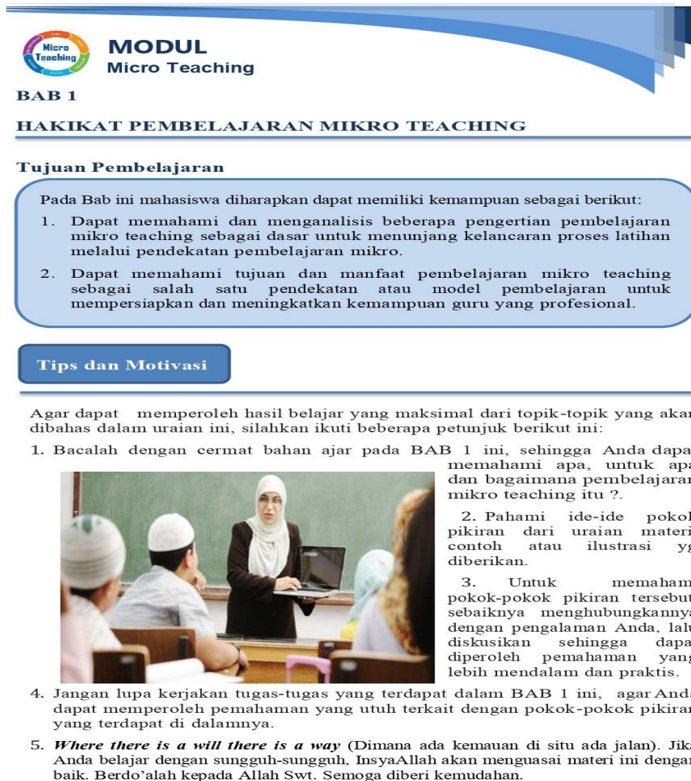
Gambar 1. Tips dan Motivasi

Based on the design, the module was developed based on student self-esteem. Here is the design of the module: