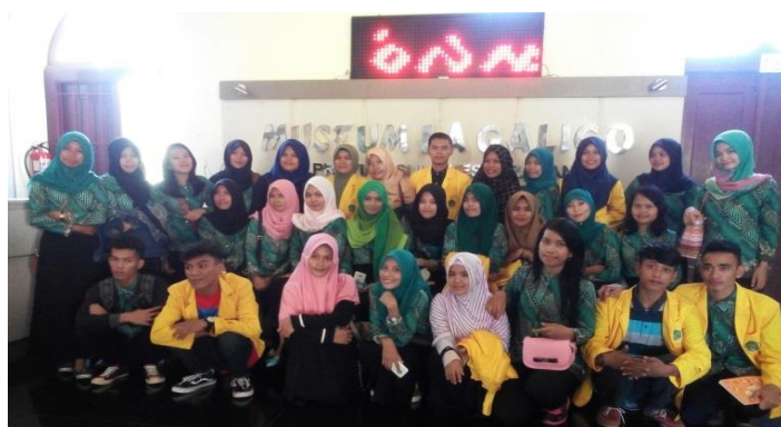
GROUP PHOTO OF THE STUDENTS AND THE LECTURERS