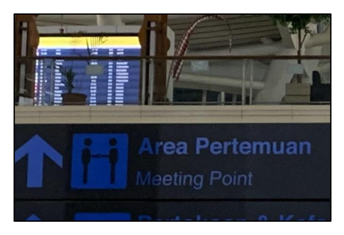
Figure 2. Area Pertemuan