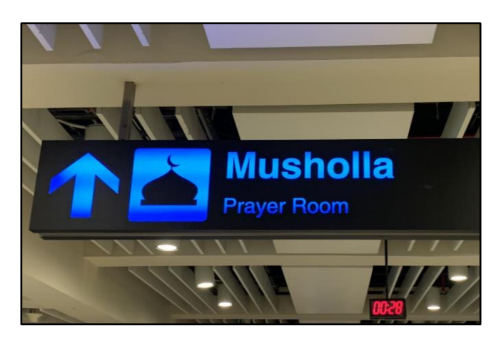
Figure 3. Musholla