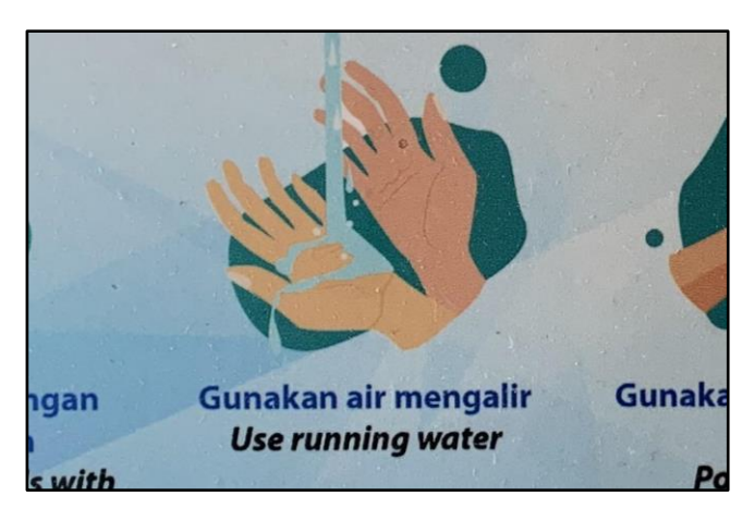
Figure 6. Gunakan Air Mengalir

SL: Gunakan Air Mengalir TL: Use Running Water