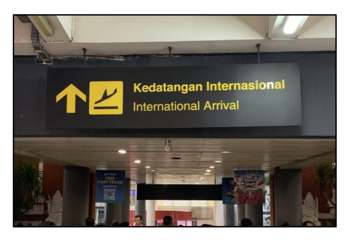
Figure 1. Kedatangan Internasional

SL: Kedatangan Internasional TL: International Arrival