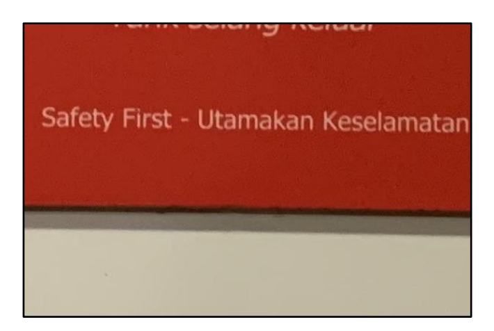
Figure 5. Utamakan Keselamatan