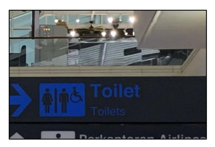
Figure 8. Toilet

Intersystem shifts of this kind have serious repercussions in the translation and interpretation of meanings from one language to another. Translators try to bring out contextual nuances more aptly expressed in the TL by way of pluralization while translating singular nouns into their plural forms. This approach allows subtler and more accurate communication of ideas, making sure that complexities are faithfully represented. In addition, the use of plural forms may also be a signal for cultural or contextual features that influence the perception of some concepts in the TL. For example, by the use of pluralization, one can extend the understanding of something in a collective manner and, hence, effectively communicate a sense of multiplicity or diversity that might be crucial in the communication process.