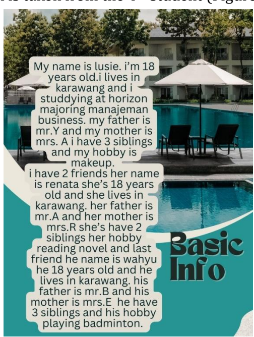
Figure 4. 4th grammar and mechanical issues

The last observation is taken from the 4th student (Figure 4).