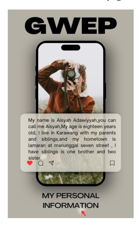
Figure 3. 3rd grammar and mechanical issues

The third analysis is taken from the 3<sup>rd</sup> student (Figure 3).