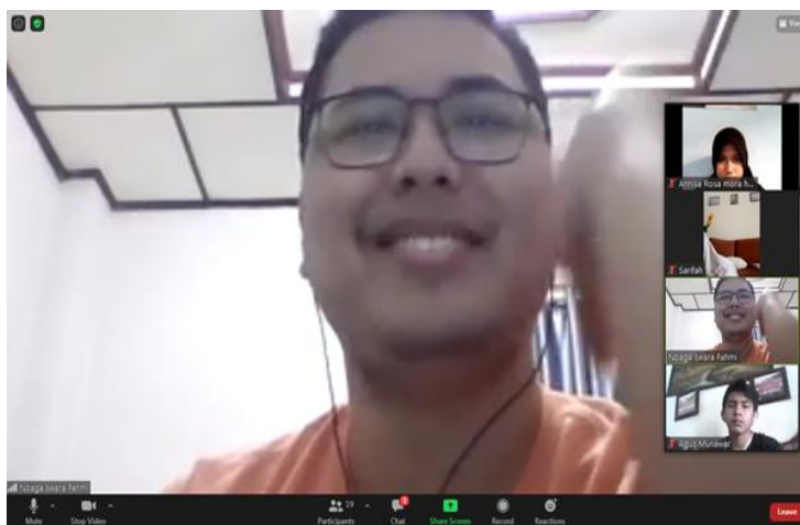
Figure 2 Sharing Idea

The most important part from this section is the students' courage in expressing their idea. Students work in pairs or small groups on a topic given by the lecturer. They have to speak up to express their idea that they know along the practice time. The lecturer observes the groups when they practice their speaking skill. When the students have question and another group can't solve their problem, the lecturer will handle the situation. One group presents the topic for 10 minutes, the process can be seen in the figure below.