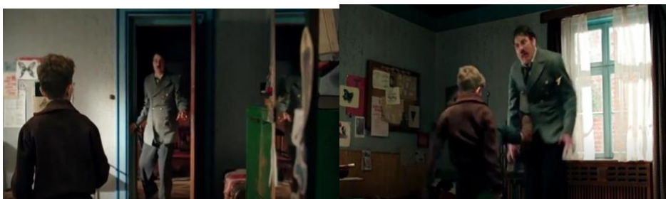
Figure 3. Jojo talks to Adolf Hitler